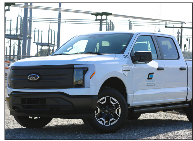
Electric vehicles like Clay Electric's Chevy Bolt and Ford F-150 Lightning still meet the criteria for a tax rebate, which now occurs at the point of sale.

New rules were introduced this year for electric vehicle (EV) tax credits, and while fewer models now qualify, the ones that do are now discounted at the point of sale rather the buyer's income tax refund as was previously the case.