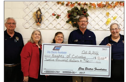
Knights of Columbus

Founded in 1991, Putnam Habitat for Humanity serves residents of Putnam County based on need. Funds from the grant will be used to support the Putnam Service Project and the Veterans Village of Palatka.