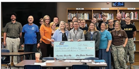
Friends of Keystone Heights High School