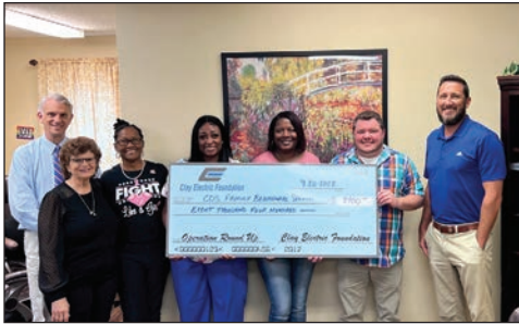
CDS Family and Behavioral Services, Inc.