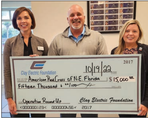
American Red Cross