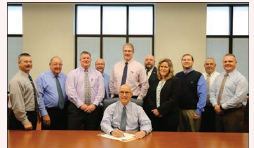
In this 2019 file photo, Davis signs the Commitment to Zero Contacts initiative.

buildings with efficient, modern facilities that made daily work safer and member service smoother. Inside those walls, he helped foster a culture of safety by adopting the national Commitment to Zero Contacts initiative, a program that reminds every employee that safety begins with leadership.