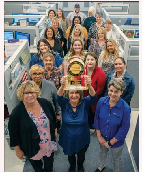
Past and present Call Center employees stand with the J.D. Power Award in this 2022 file photo.

He leaves behind not just an upgraded grid, but a legacy of steadiness, showing that lasting change is built the same way he built his career: from the ground up.