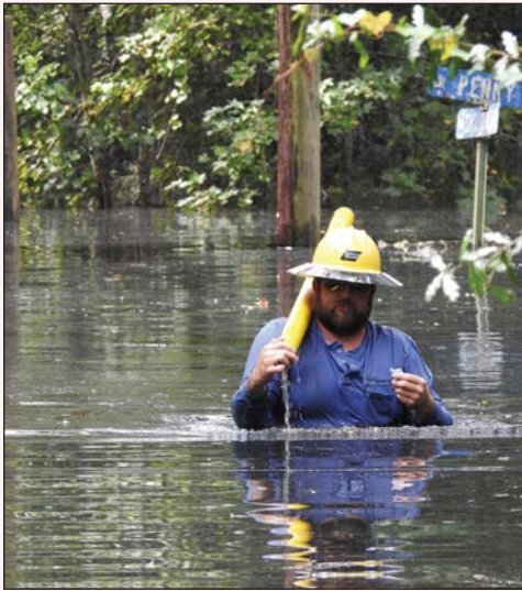
A Clay Electric lineworker treads through torrential floodwaters in Lake City following Hurricane Irma in 2017.