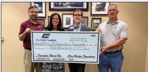
The College of Central Florida received $10K from Operation Round Up.