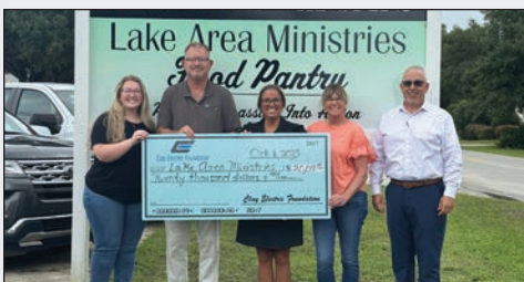
Lake Area Ministries received a $20K grant check.

As of the end of the year, $8.23 million in grants had been made to 365 local organizations . You can see photos from all the check presentations monthly on Facebook at Clay Electric Co-op .