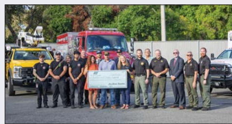
A $20K grant check with to Bradford Sheriff Charitable Foundation.