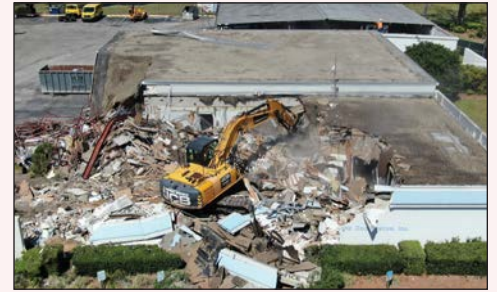
A crew works to demolish the old Keystone Heights District Office in this 2021 file photo.

Davis led the construction of a new headquarters and district offices — replacing outdated, overcrowded