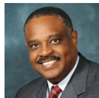
Al Lawson (D) US House District 5 Columbia & Baker counties

1626 Longworth House Building Washington, DC 20515 202-225-5744 Gainesville: 5500 NW 111th Blvd., Suite A Gainesville, FL 32653 352-505-0838 Orange Park: 35 Knight Boxx Road, Suite 1 Orange Park, FL 32065 904-276-9626 cammack.house.gov