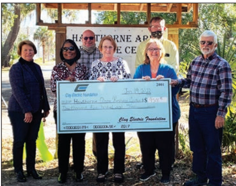
Hawthorne Area Resource Center