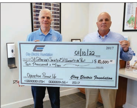
St. Catherine's Society