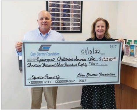
Episcopal Children's Services

Hawthorne Area Resource Center Inc. is a collaborative effort between the First United Methodist Hawthorne and the Episcopal Church of the Holy Communion to serve the most vulnerable population as a food pantry and resource center within Hawthorne and