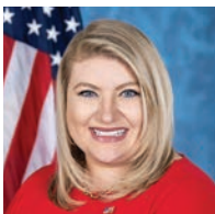
Kat Cammack (R) US House District 3 Alachua, Bradford, Clay, Columbia, Marion, Putnam & Union counties

2184 Rayburn House Office Building Washington, DC 20515 202-225-1002 The Villages: 8015 E. County Road 466, Suite B The Villages, FL 32612 352-383-3552 webster.house.gov