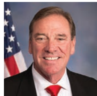
Neal Dunn (R) US House District 2 Columbia, Gilchrist, Levy & Suwannee counties

206 S. Hwy 27/441 Lady Lake, FL 32159 352-750-3133 Tallahassee: 412 Senate Office Building 404 S. Monroe St. Tallahassee, FL 32399-1100 850-487-5012