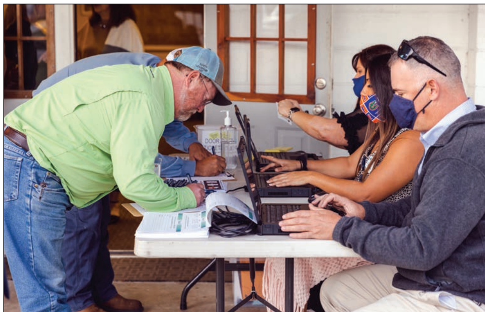
A member registers to vote at the District 9 trustee meeting on Jan. 13 in Fort McCoy.