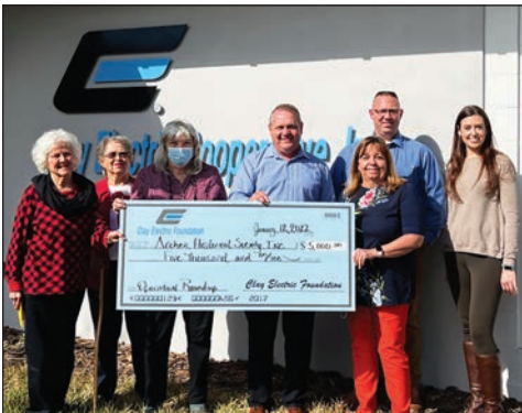
Archer Historical Society