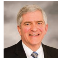
Daniel Webster (R) US House District 11 Marion County

316 Cannon House Office Building Washington, DC 20515 202-225-5235 Tallahassee: 300 S. Adams St. Tallahassee, FL 32301 850-891-8610 dunn.house.gov